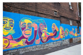
Putting her mark on the walls of...