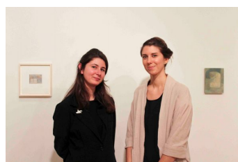
Two artists, two mediums, one exhibition