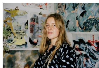
Exploring biodiversity and natural 'muck'